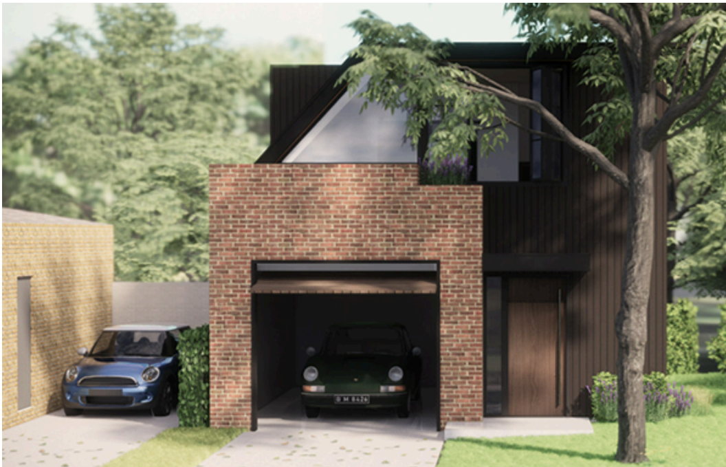
Single-vehicle garden suite from Toronto's Eva Lanes www.evalanes.com

The new garden suite regulations received political approval at Toronto City Hall on February 2, 2022, and on July 4, 2022 emerged successfully from an appeal process that had delayed the implementation slightly.