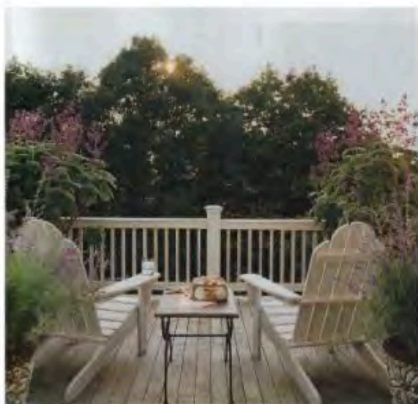
When you wake here, leave your worries at home, rest and relaxation are the orders of the day. Have a pool drink at cocktail hour, or find your own spot to chill out— the house and garden are full of nooks where you can unwind.