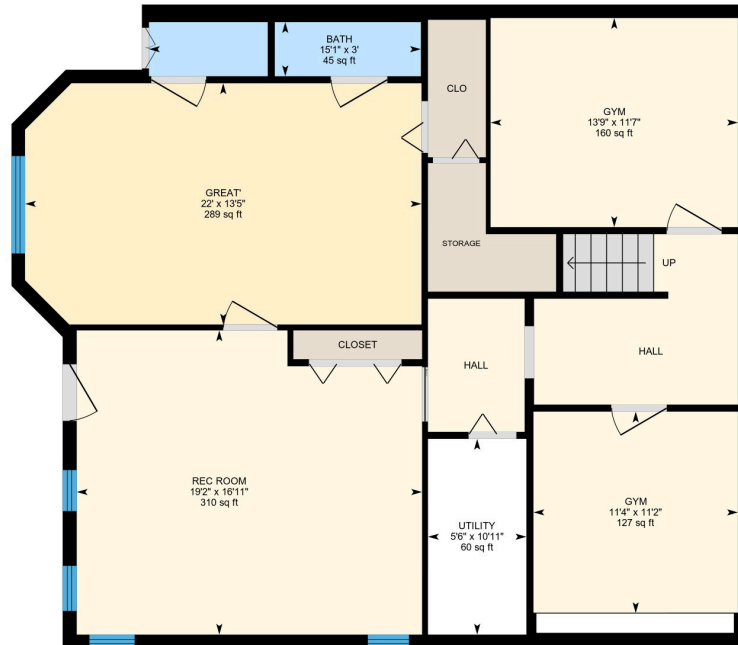
Basement Level Floor Plan

Basement (Below Grade) Finished Area 1296.74 sq ft Unfinished Area 64.57 sq ft