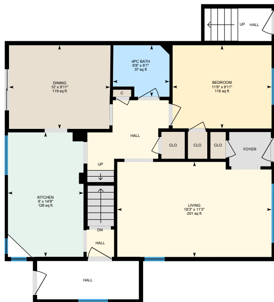
Main Floor Exterior Area 846.37 sq ft

Main Building: Total Exterior Area Above Grade 1415.54 sq ft