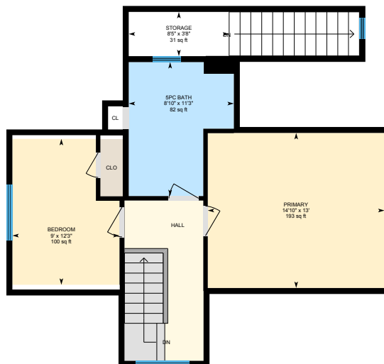
2nd Floor Exterior Area 569.16 sq ft