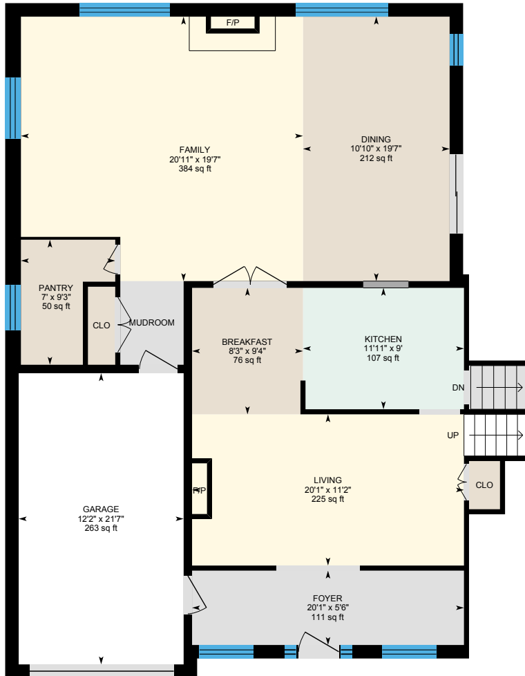
Main Floor Exterior Area 1394.09 sq ft

Main Building: Total Exterior Area Above Grade 2035.82 sq ft