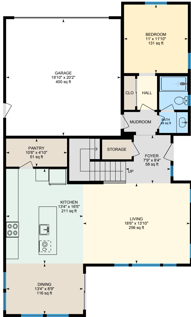
1st Floor Finished Area 1121.50 sq ft

Main Building: Above Grade Finished Area 2436.70 sq ft