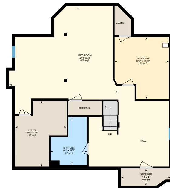
Basement (Below Grade) Exterior Area 1242.38 sq ft