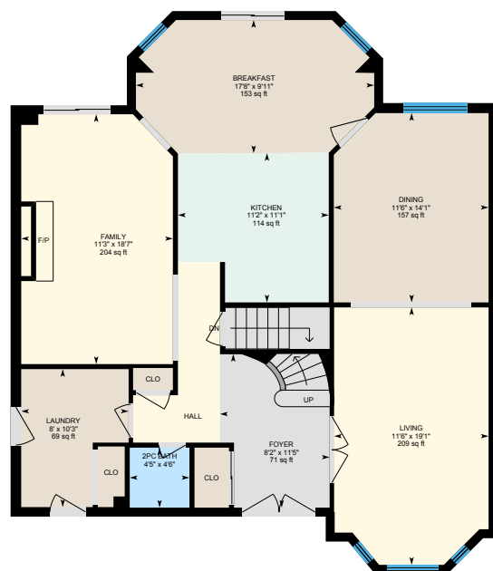
Main Floor Exterior Area 1266.18 sq ft

Main Building: Total Exterior Area Above Grade 2452.53 sq ft