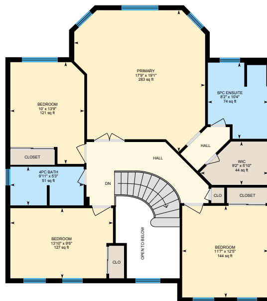
2nd Floor Exterior Area 1186.36 sq ft