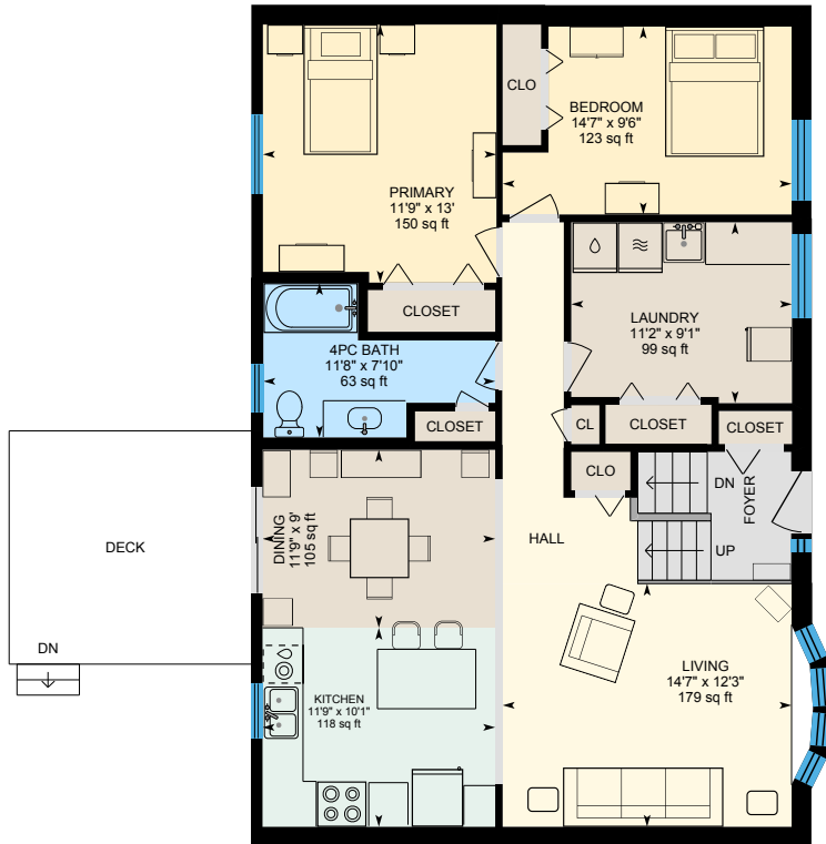
Main Floor Exterior Area 1215.23 sq ft

Main Building: Total Exterior Area 2387.57 sq ft