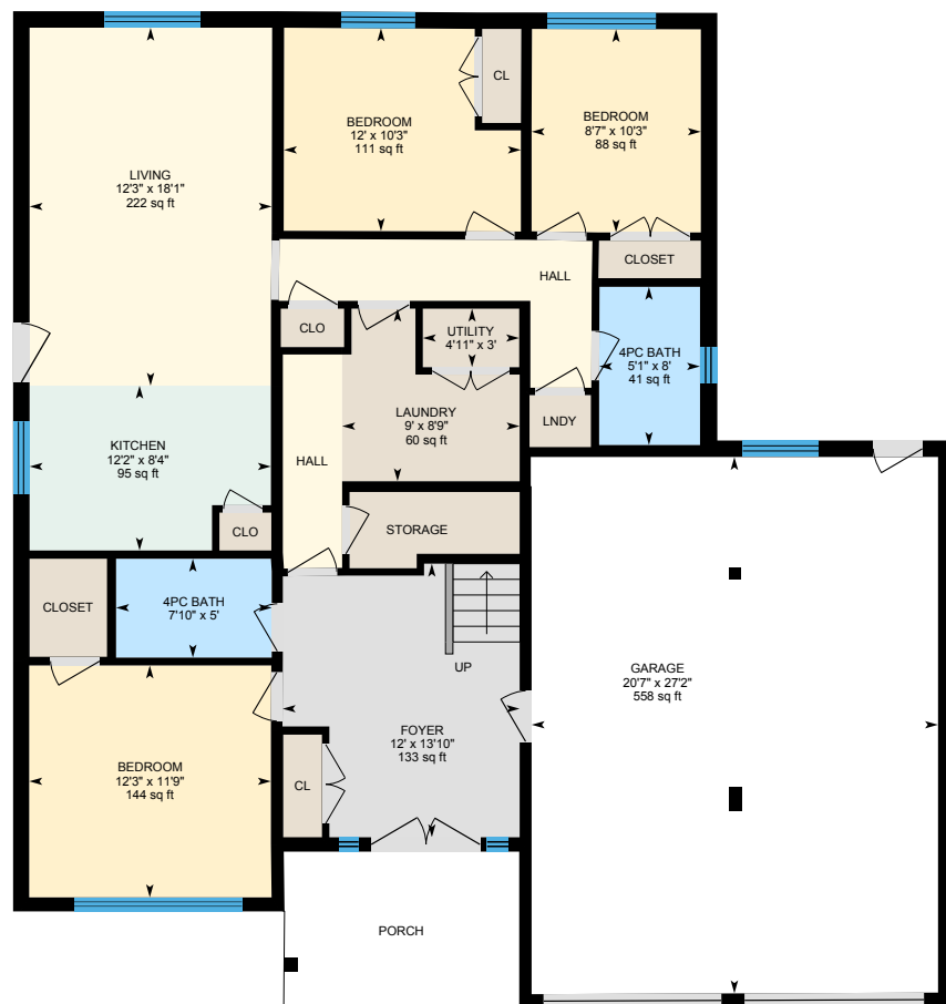
Main Floor Exterior Area 1369.02 sq ft

Main Building: Total Exterior Area Above Grade 3169.38 sq ft