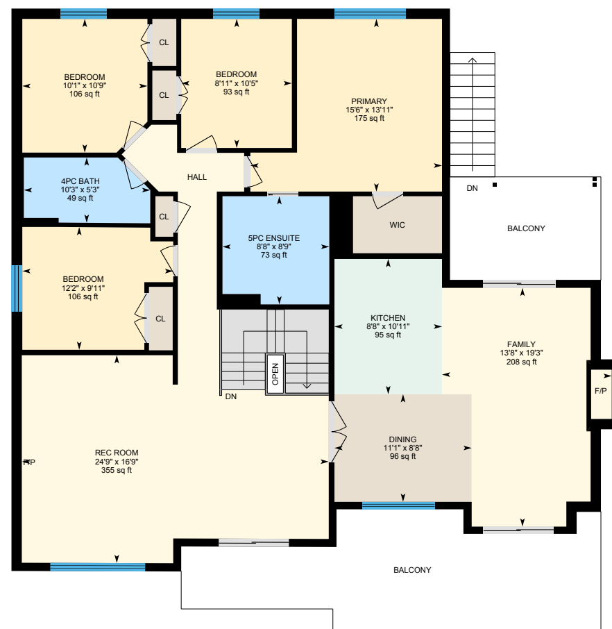
1st Floor Exterior Area 1800.37 sq ft