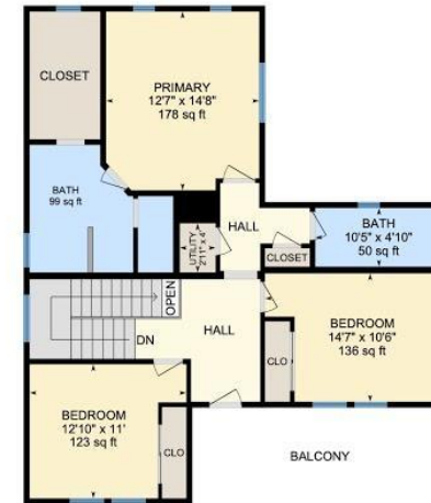
2nd Floor Exterior Area 1011.71 sq ft