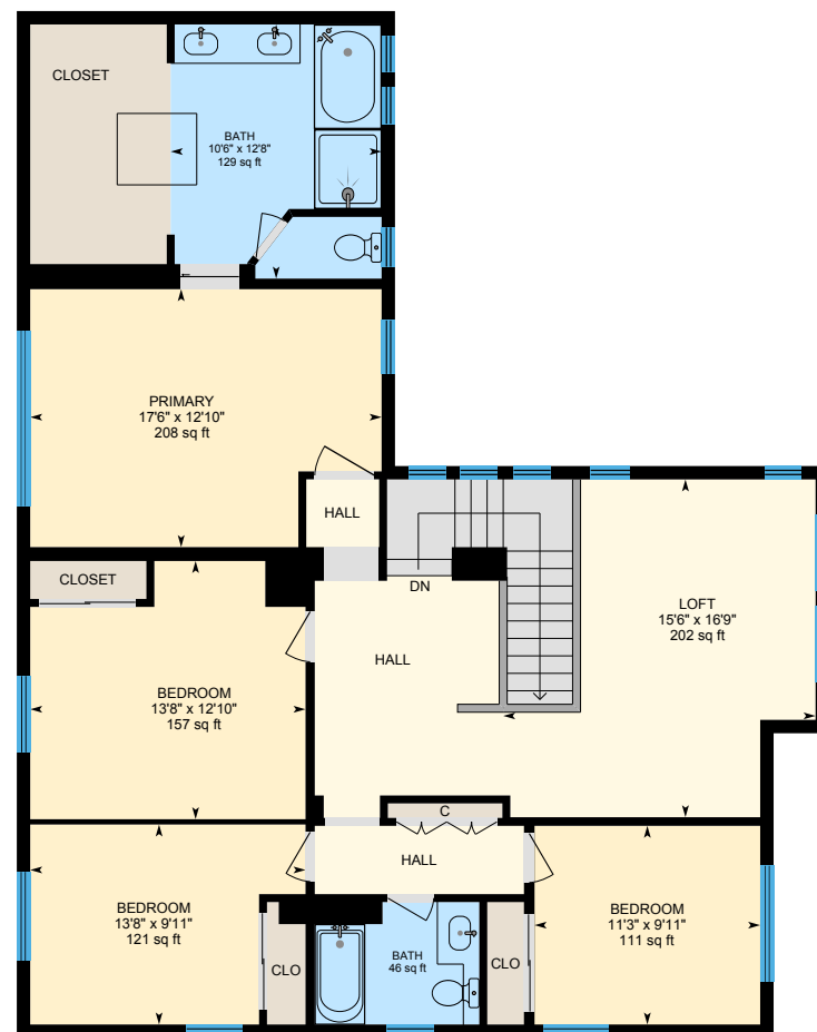
2nd Floor Finished Area 1530.53 sq ft