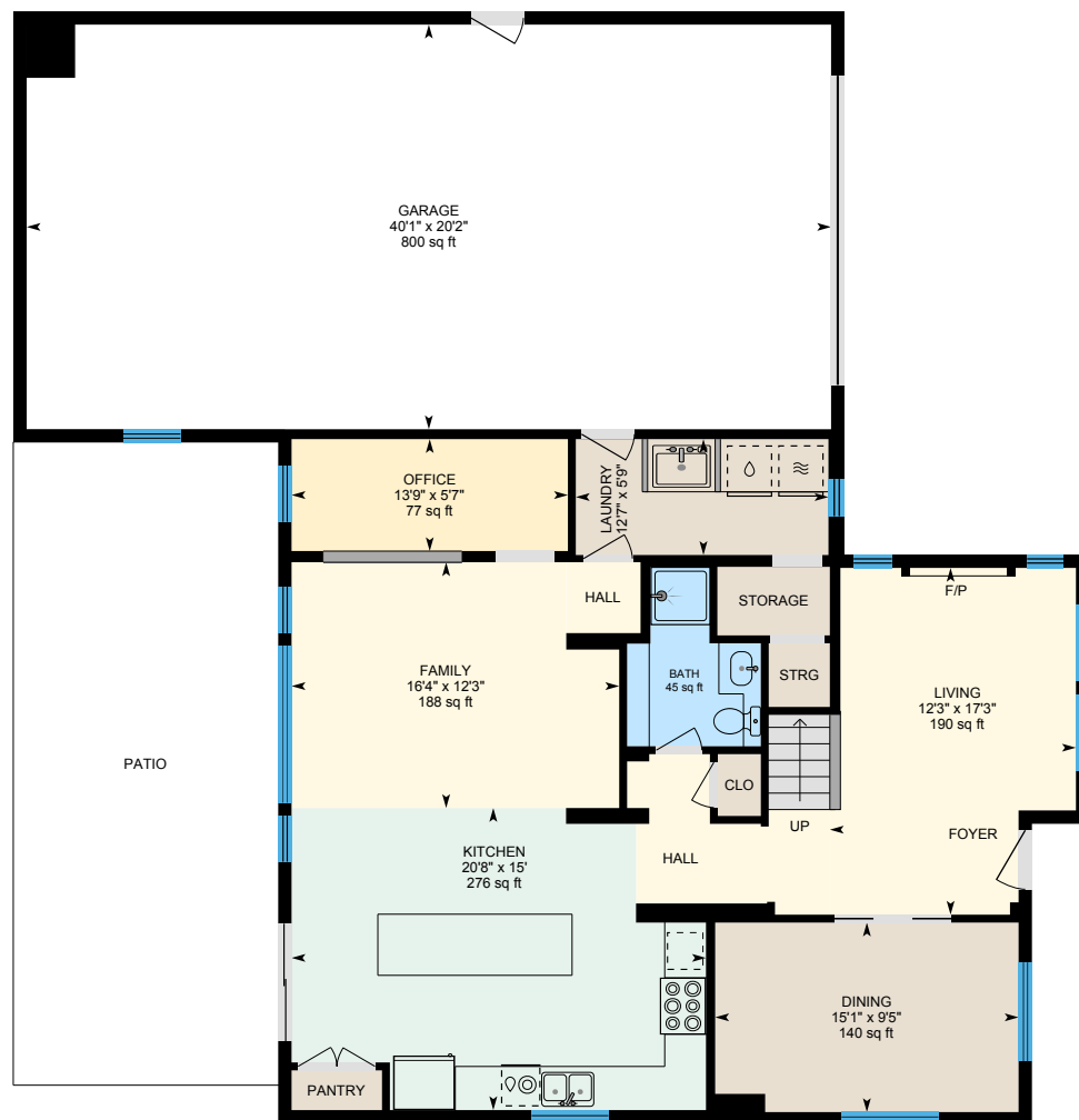
1st Floor Finished Area 1277.42 sq ft

Main Building: Above Grade Finished Area 2807.95 sq ft