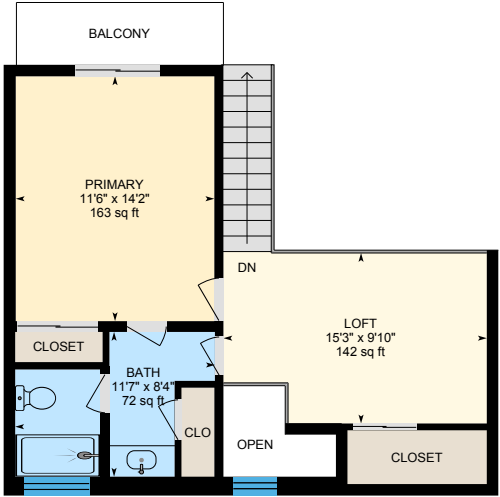
2nd Floor Finished Area 530.53 sq ft