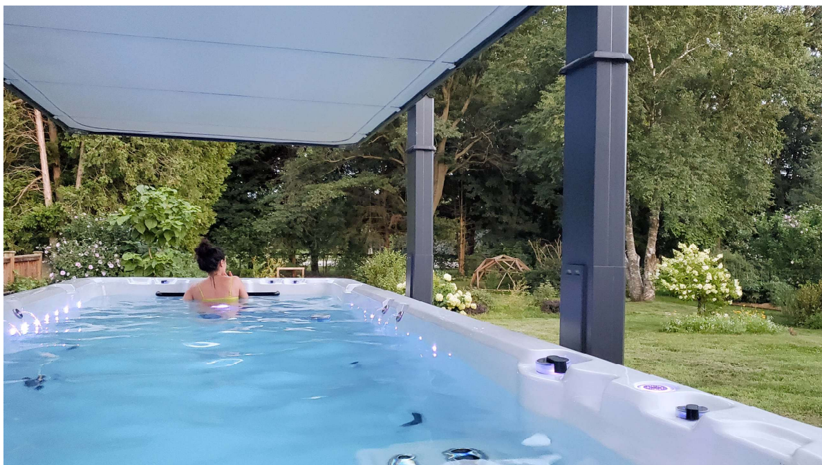
Swim Spa Aqua Lap Pro+