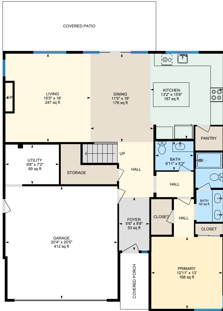
1st Floor Finished Area 1300.83 sq ft

Main Building: Above Grade Finished Area 2907.63 sq ft