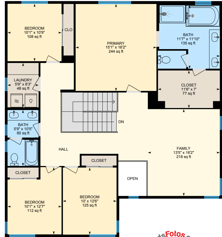
2nd Floor Finished Area 1606.80 sq ft