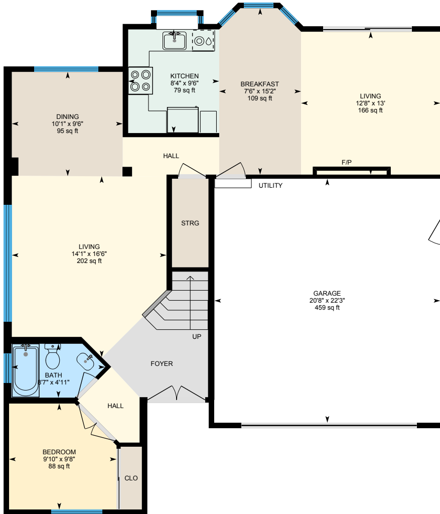
1st Floor Finished Area 1056.19 sq ft

Main Building: Above Grade Finished Area 1909.96 sq ft