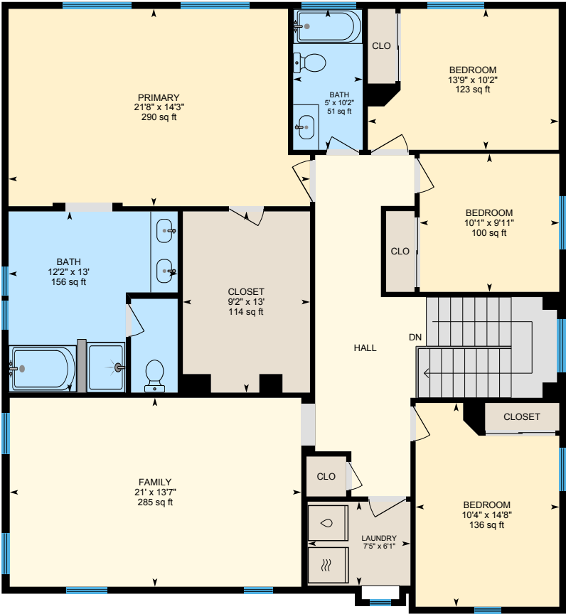
2nd Floor Finished Area 1743.73 sq ft