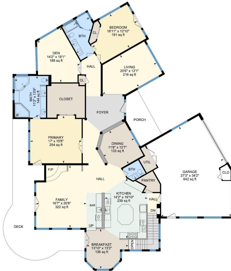
1st Floor Finished Area 2974.78 sq ft