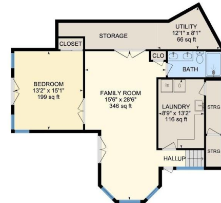
Lower Level Finished Area 1096.88 sq ft