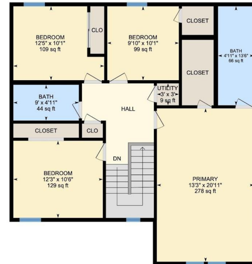
2nd Floor Exterior Area 1105.70 sq ft