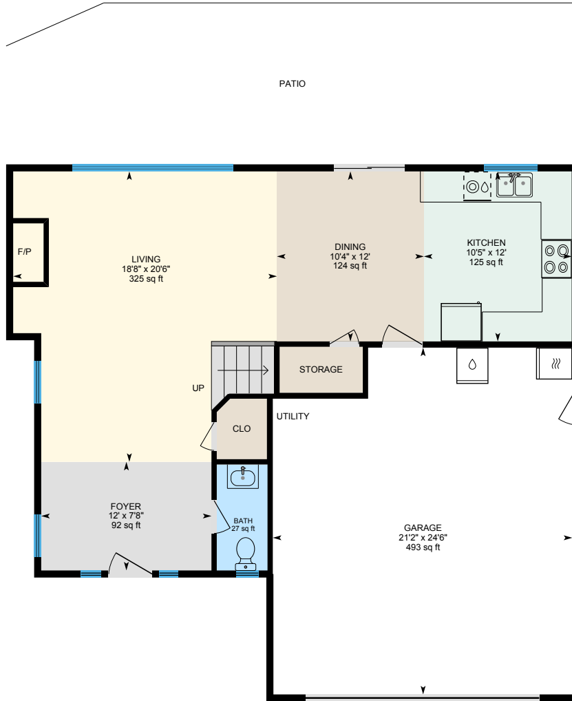
1st Floor Finished Area 819.52 sq ft

Main Building: Above Grade Finished Area 1644.49 sq ft