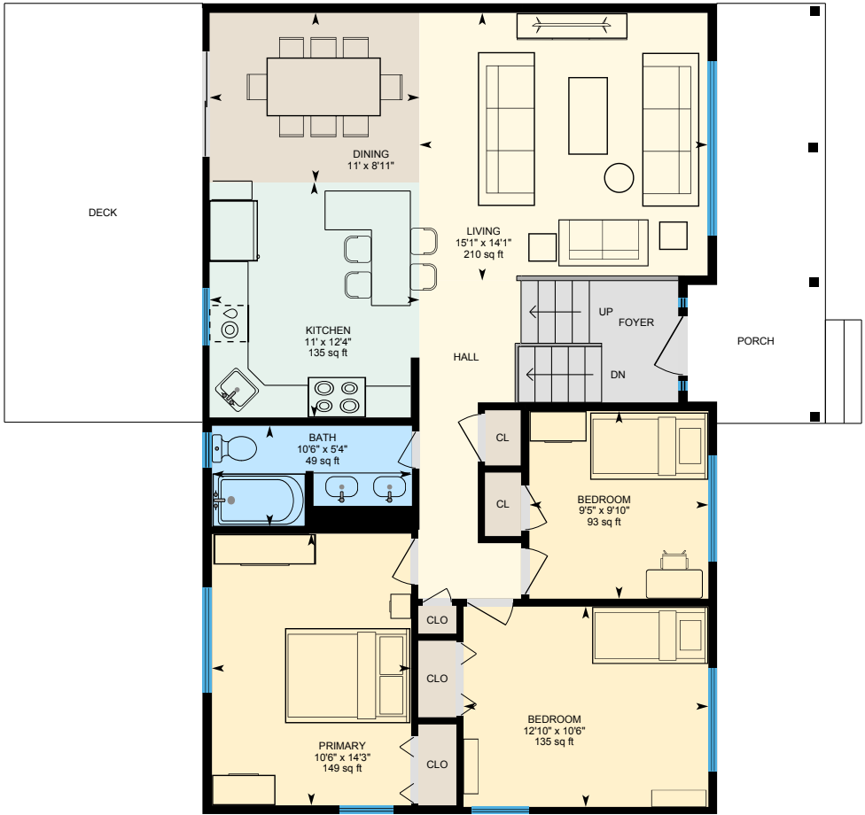
2nd Floor Finished Area 1147.29 sq ft