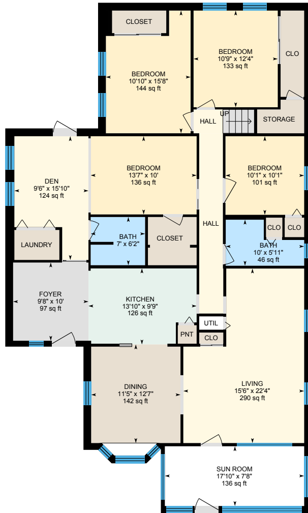
Main Floor Finished Area 1910.09 sq ft

Main Building: Above Grade Finished Area 2395.84 sq ft