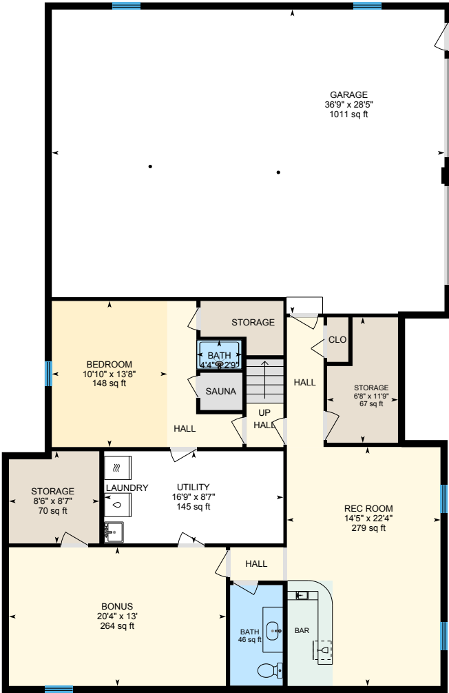
Basement (Below Grade) Finished Area 1272.71 sq ft