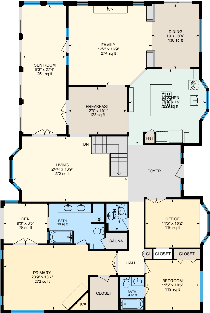
Main Floor Finished Area 2603.49 sq ft

Main Building: Above Grade Finished Area 2603.49 sq ft