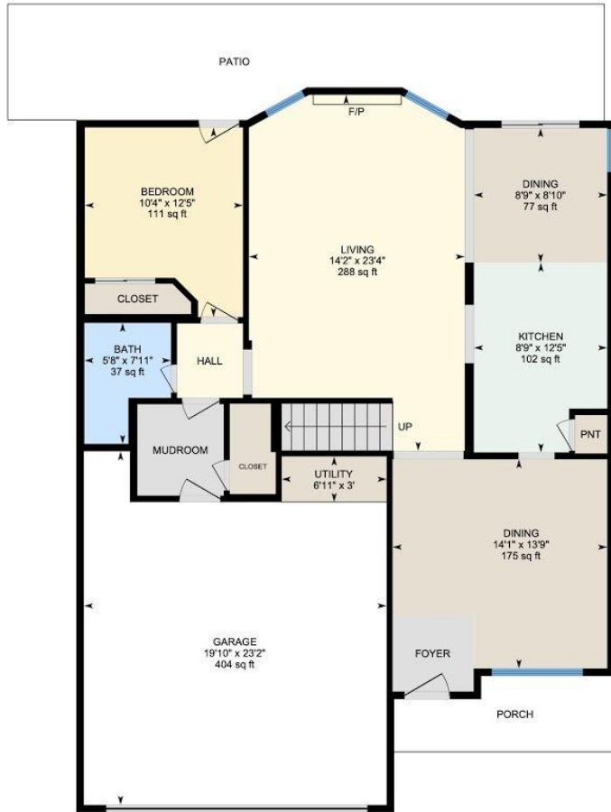
1st Floor Exterior Area 1079.39 sq ft

Main Building: Total Exterior Area Above Grade 2216.18 sq ft