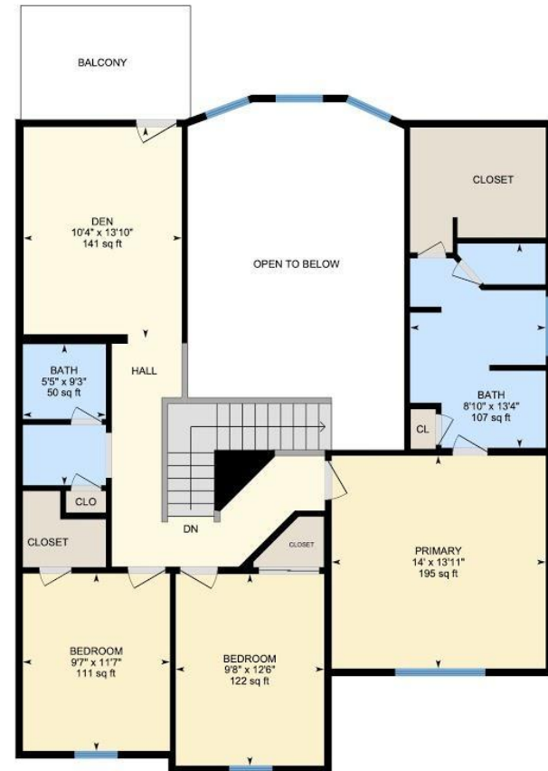
2nd Floor Exterior Area 1136.79 sq ft