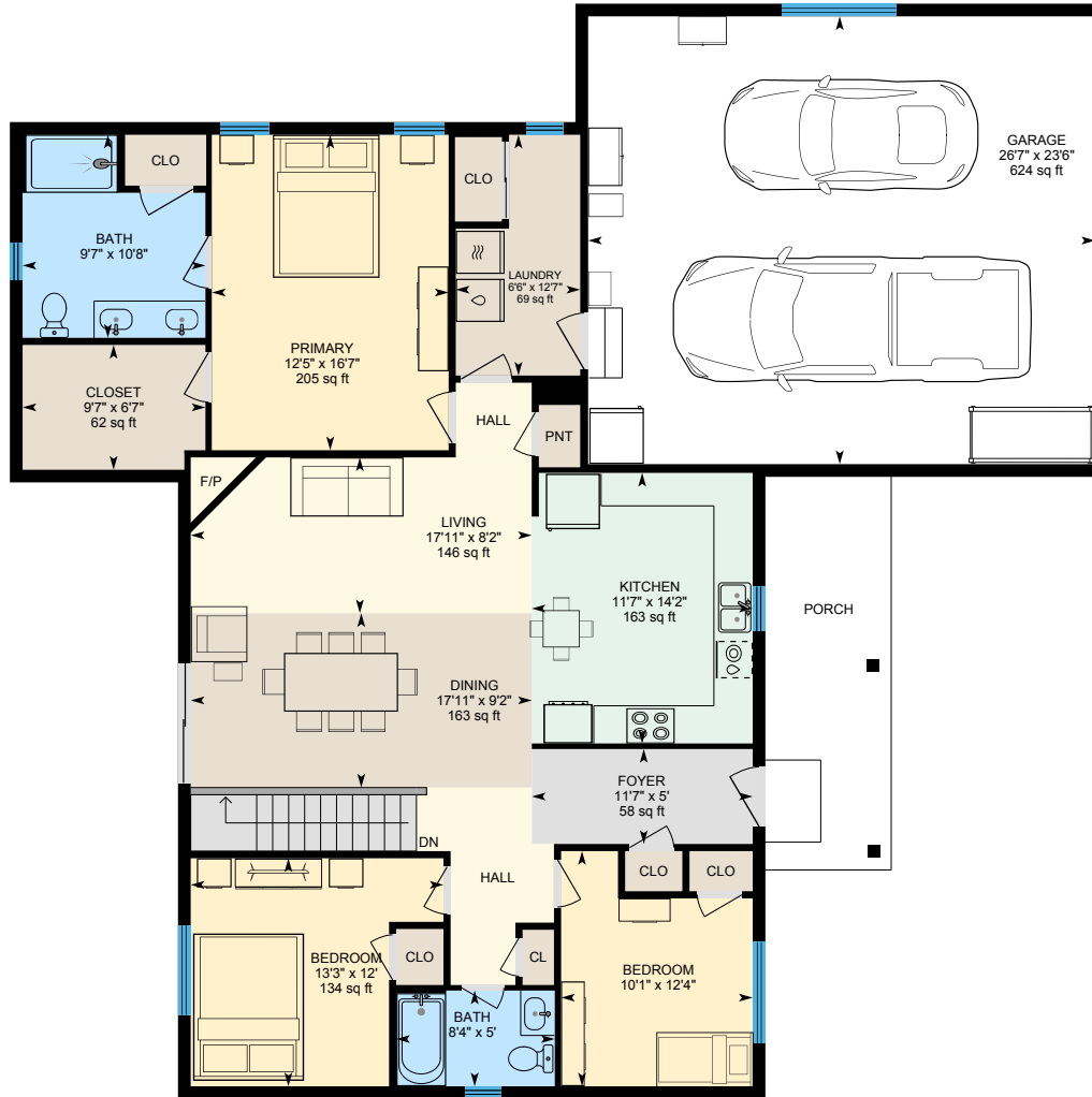
Main Floor Finished Area 1576.34 sq ft

Main Building: Above Grade Finished Area 1576.34 sq ft