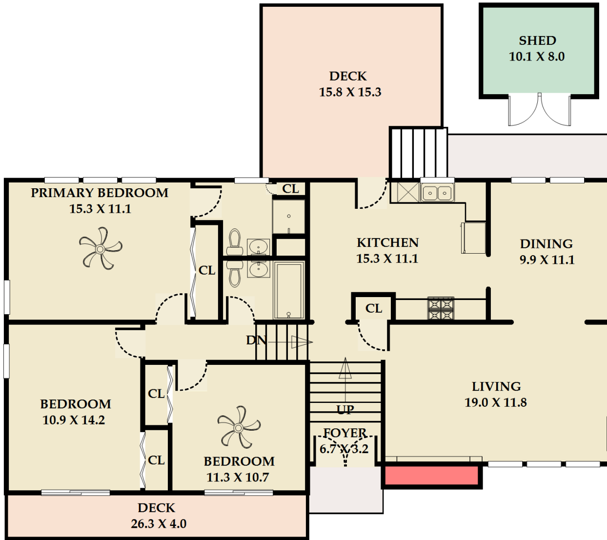
MAIN & UPPER LEVEL