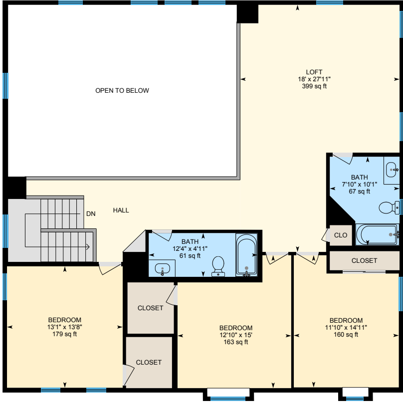
2nd Floor Finished Area 1476.32 sq ft