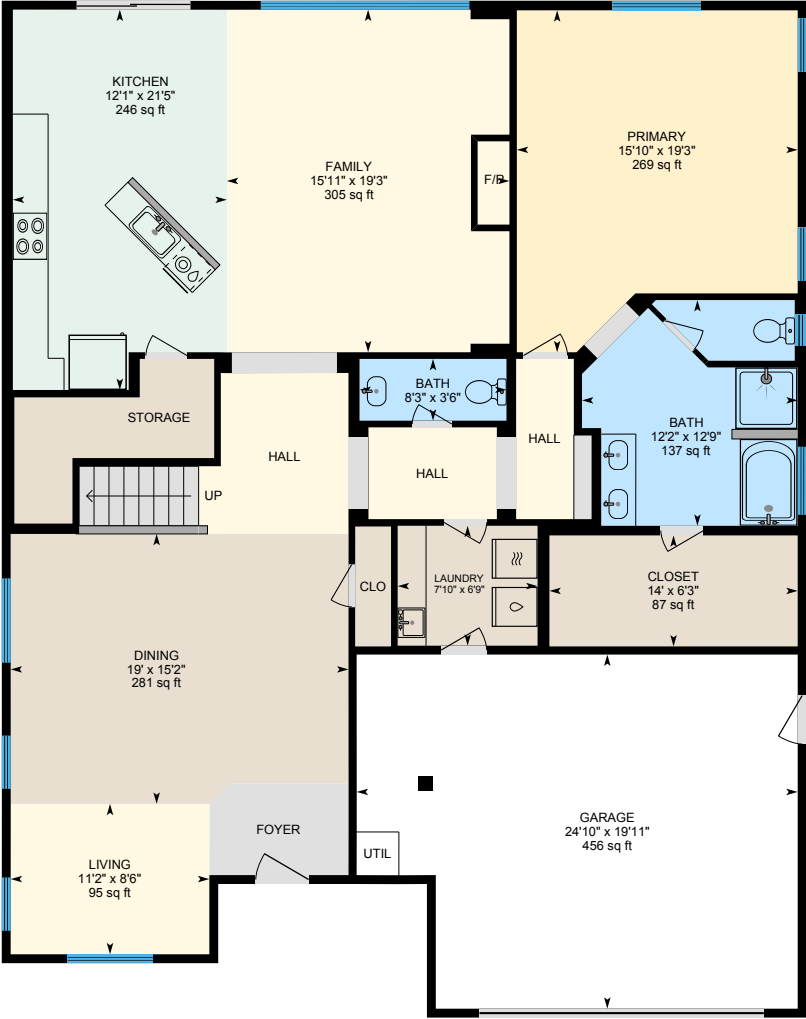
1st Floor Finished Area 1974.31 sq ft

Main Building: Above Grade Finished Area 3450.64 sq ft