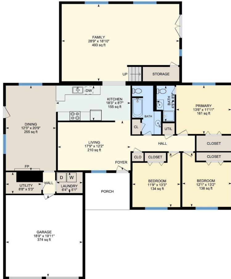
Main Floor Exterior Area 2190.00 sq ft