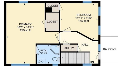
2nd Floor Exterior Area 608.67 sq ft