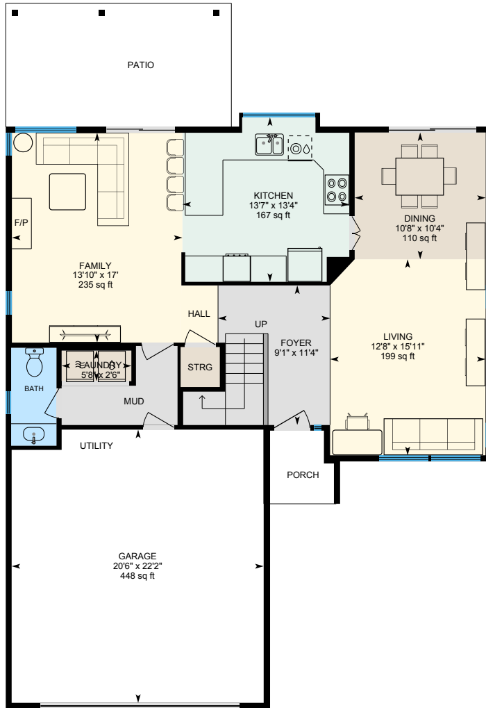
1st Floor Finished Area 1024.04 sq ft

Main Building: Above Grade Finished Area 1903.47 sq ft