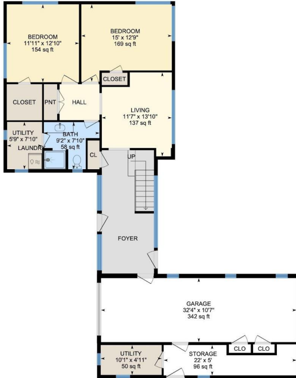
1st Floor Finished Area 1031.23 sq ft