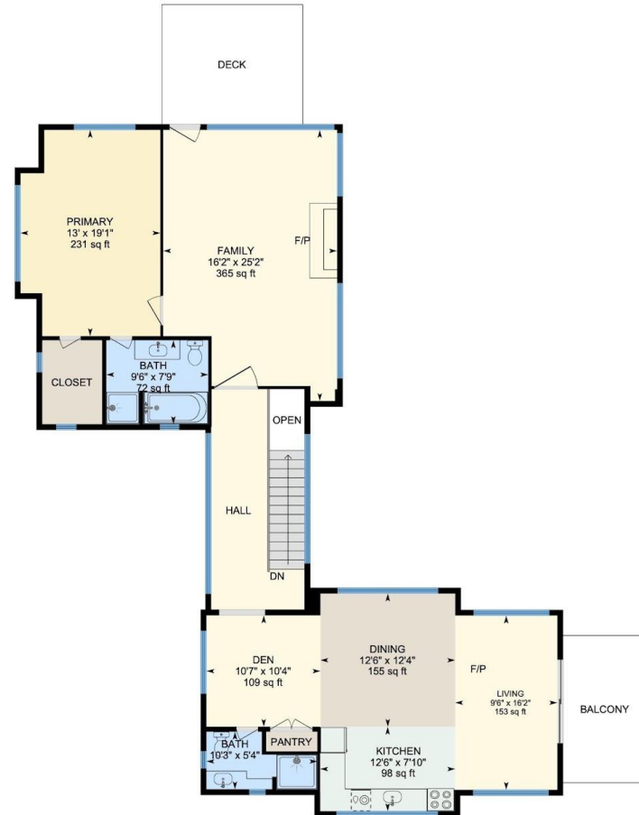
2nd Floor Finished Area 1599.99 sq ft