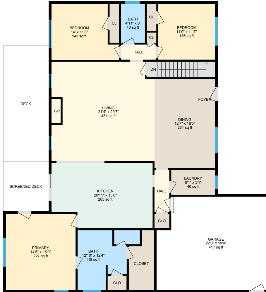
Main Floor Finished Area 2045.93 sq ft

Main Building: Above Grade Finished Area 2045.93 sq ft