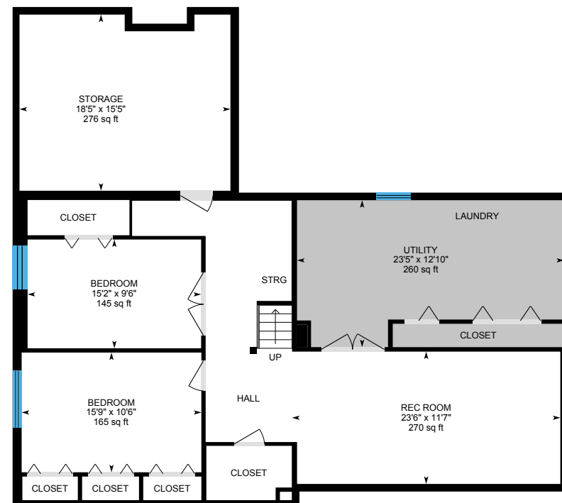
Basement (Below Grade) Exterior Area 439.61 sq ft