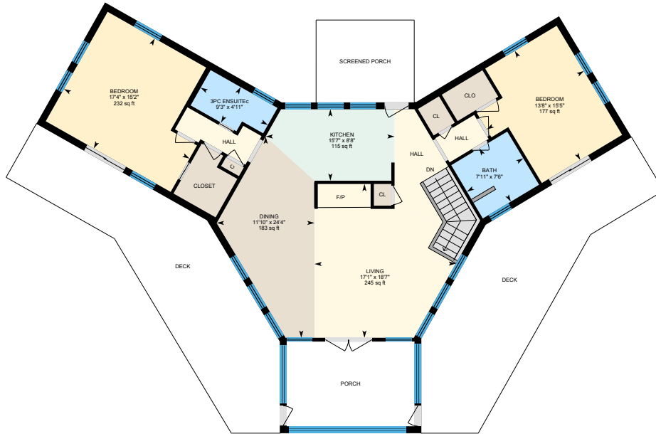
Main Floor Finished Area 1487.89 sq ft

Main Building: Above Grade Finished Area 2877.83 sq ft