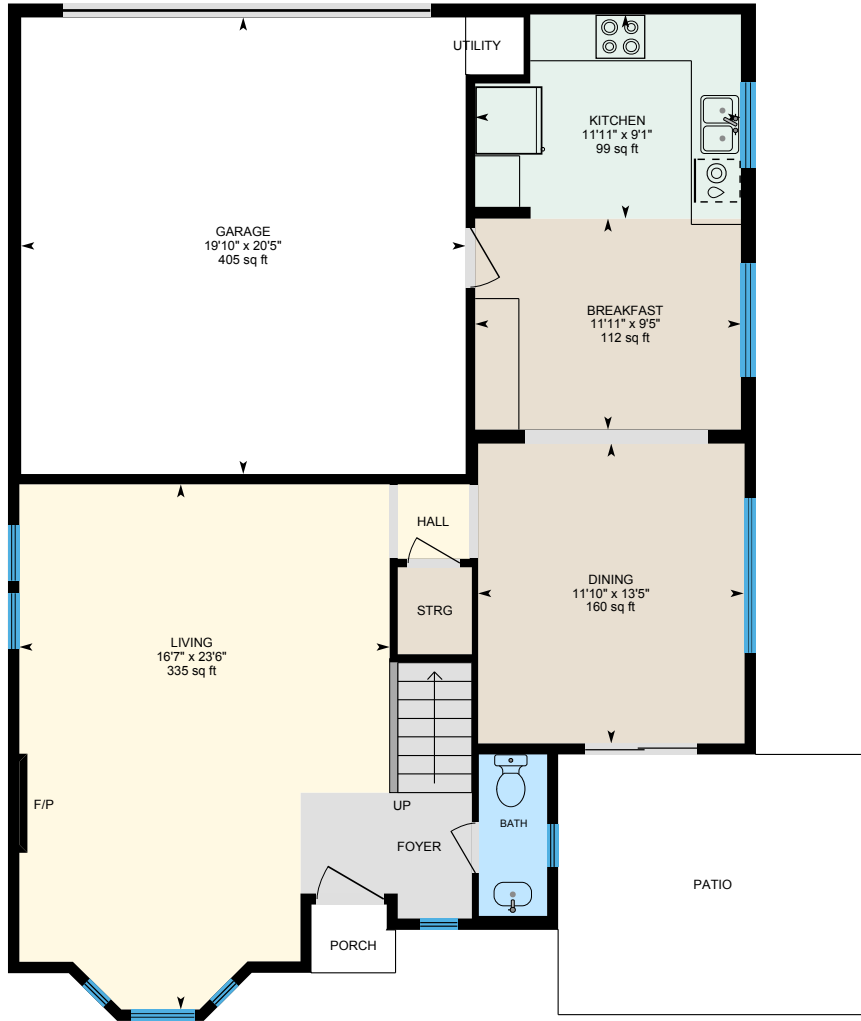
1st Floor Finished Area 907.59 sq ft

Main Building: Above Grade Finished Area 2321.38 sq ft