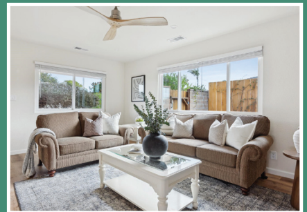
Open living space