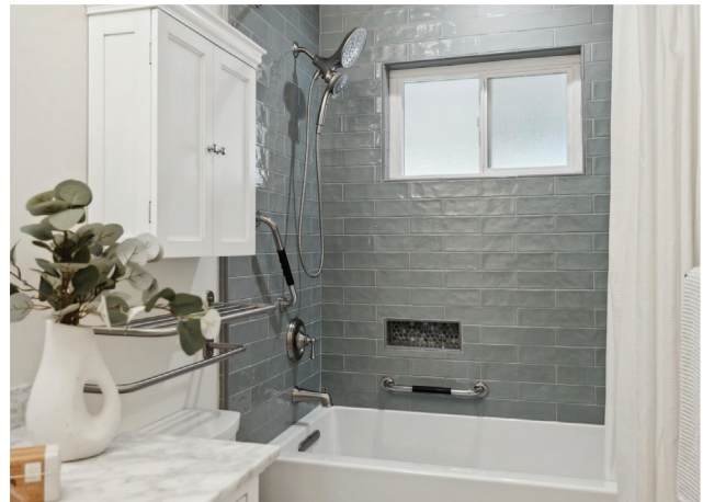
Stylish bathrooms with new tubs