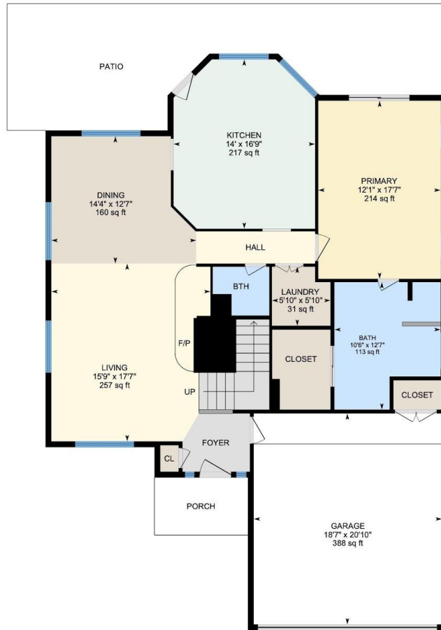
1st Floor Finished Area 1352.01 sq ft