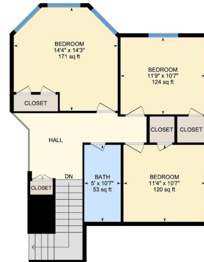
2nd Floor Finished Area 788.74 sq ft