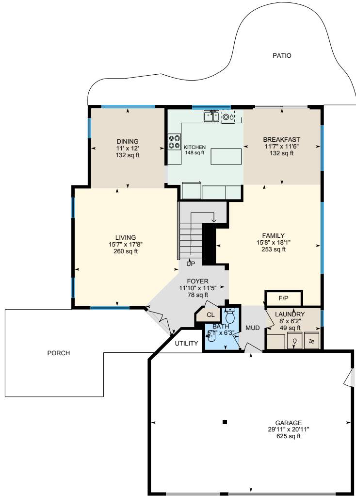
1st Floor Finished Area 1270.13 sq ft

Main Building: Above Grade Finished Area 2661.87 sq ft