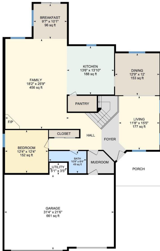
1st Floor Exterior Area 1717.67 sq ft