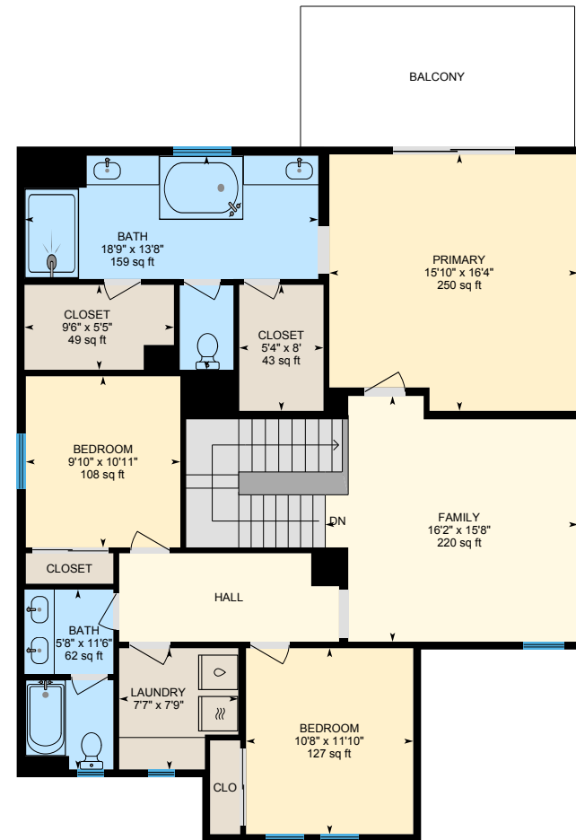
2nd Floor Finished Area 1430.85 sq ft