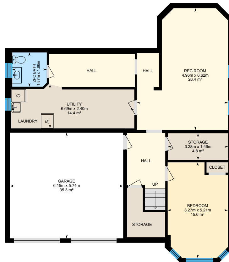
Basement (Below Grade) Exterior Area 104.49 m 2