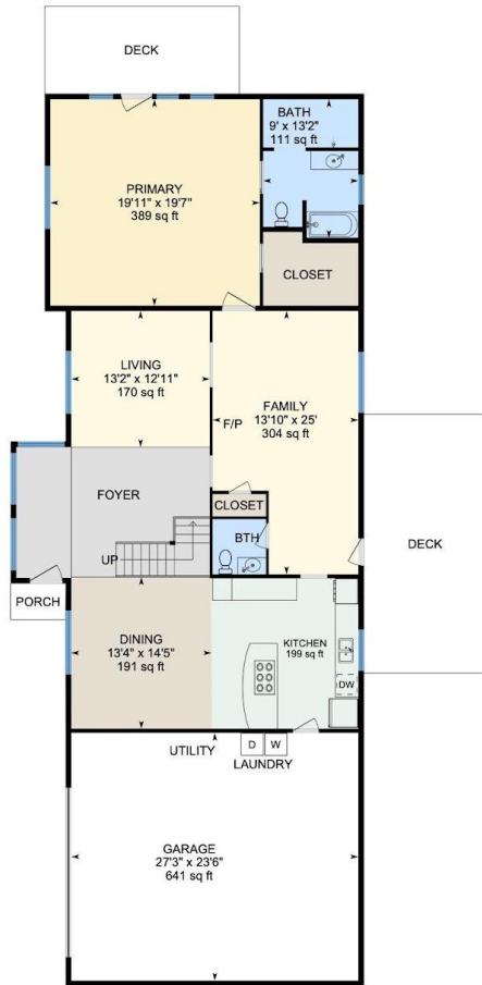
1st Floor Exterior Area 1835.00 sq ft