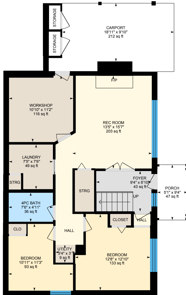
Entry Level (7ft 10in) Exterior Area 986.40 sq ft

Main Building: Total Exterior Area Above Grade 1989.36 sq ft