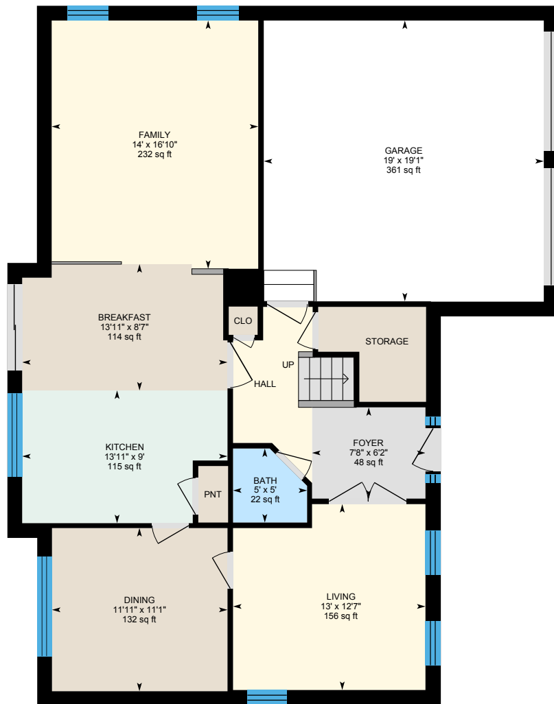
Main Floor Finished Area 1093.81 sq ft

Main Building: Above Grade Finished Area 2336.70 sq ft