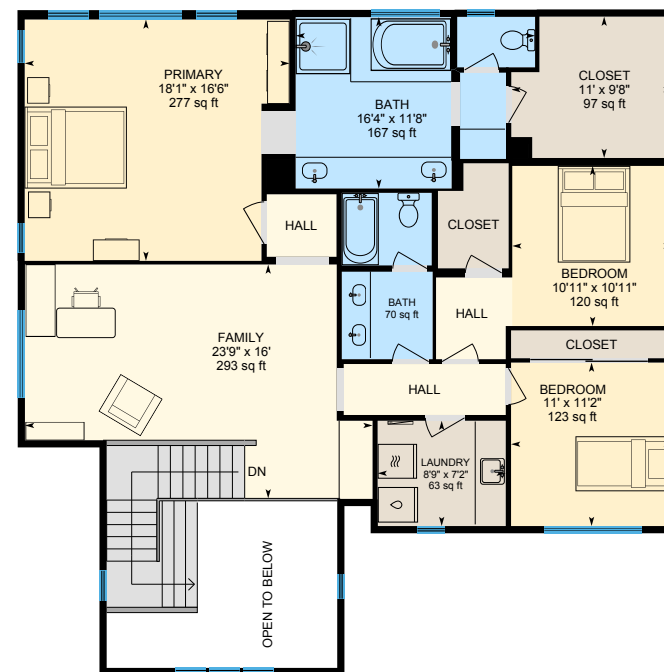
2nd Floor Finished Area 1590.30 sq ft