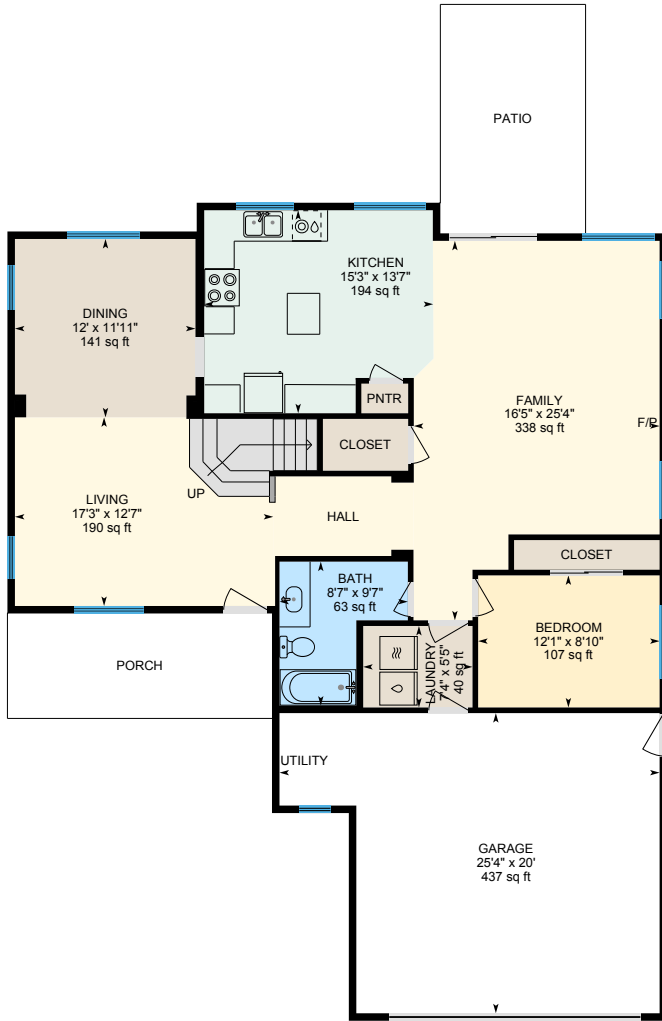
1st Floor Finished Area 1325.29 sq ft

Main Building: Above Grade Finished Area 2347.58 sq ft