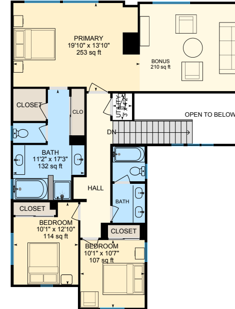
2nd Floor Finished Area 1186.08 sq ft