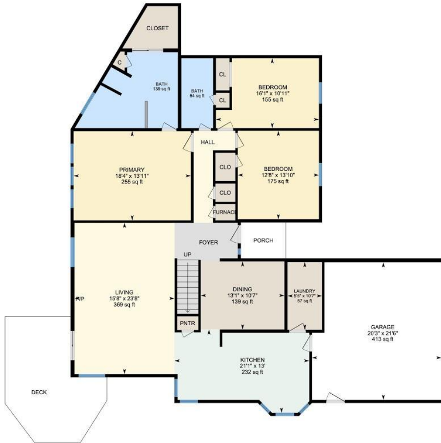
1st Floor Exterior Area 2023.26 sq ft

Main Building: Total Exterior Area Above Grade 2569.17 sq ft