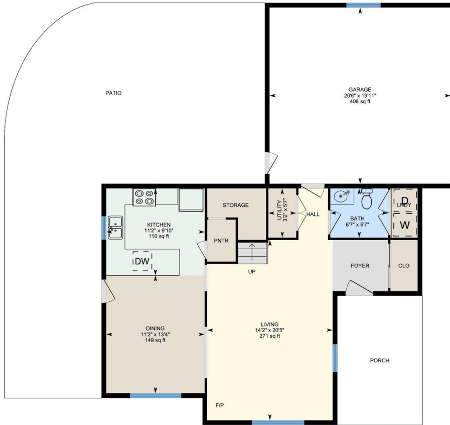
1st Floor Exterior Area 816.67 sq ft

Main Building: Total Exterior Area Above Grade 1588.99 sq ft