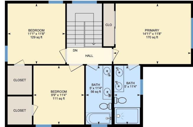
2nd Floor Exterior Area 772.33 sq ft