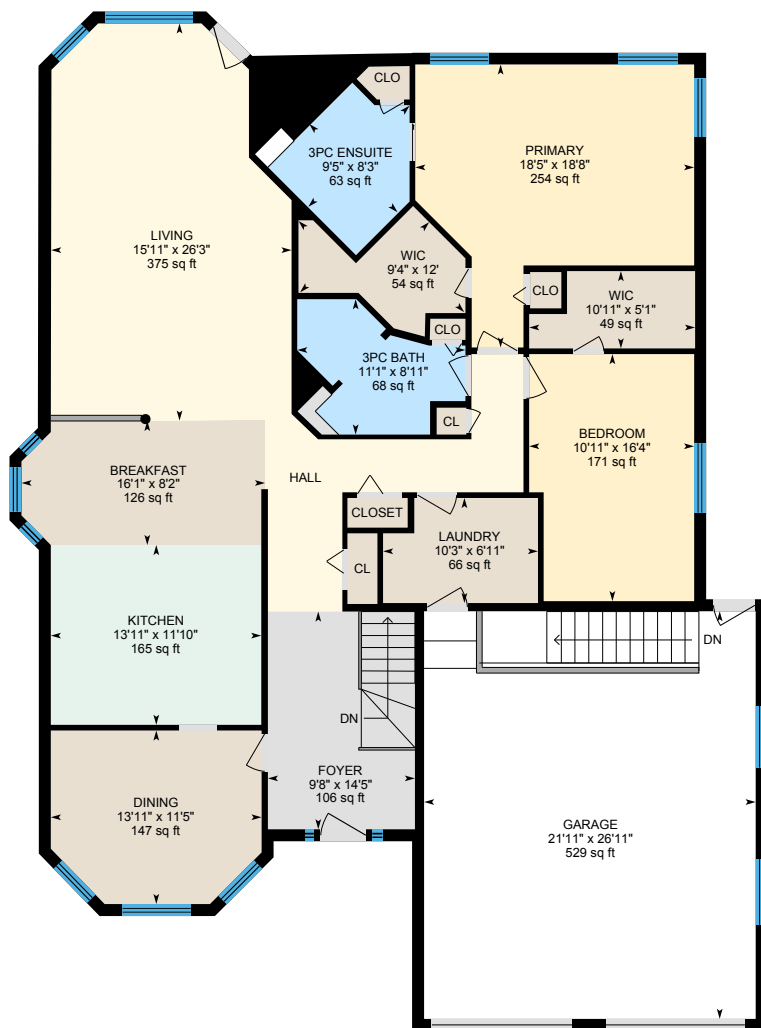
Main Floor Exterior Area 2112.00 sq ft

Main Building: Total Exterior Area Above Grade 2112.00 sq ft