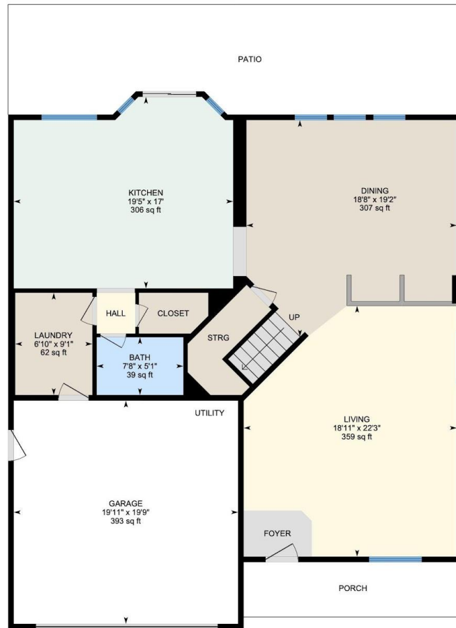
1st Floor Exterior Area 1320.23 sq ft