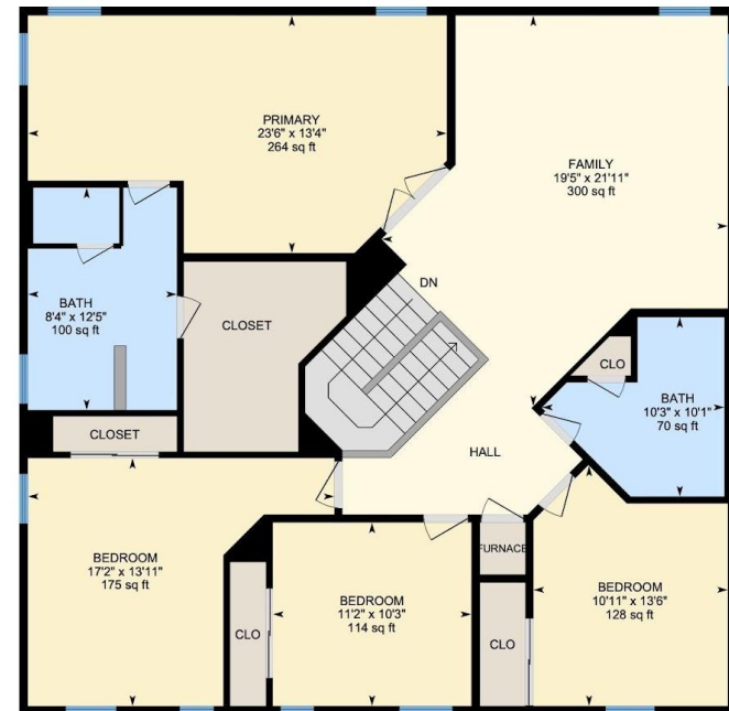
2nd Floor Exterior Area 1595.27 sq ft