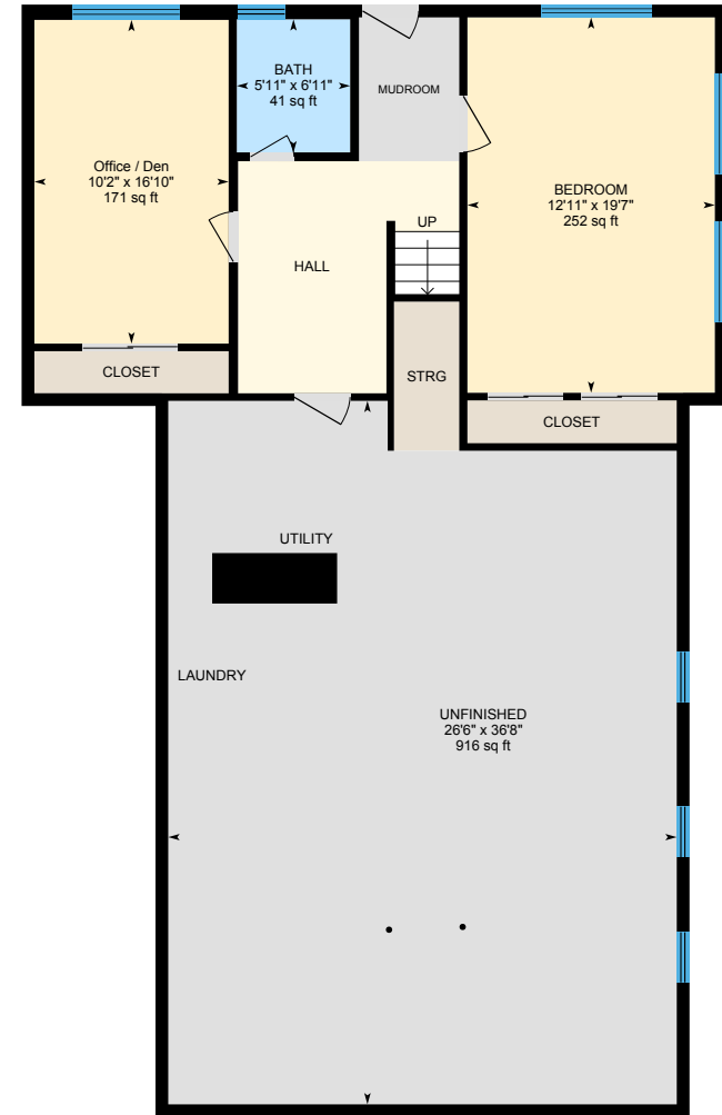
Lower Level (Below Grade) Finished Area 779.08 sq ft